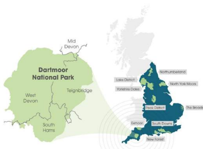
Figure 1: Map showing the 10 English National Parks and Dartmoor National Park

The Management Plan outlines the key drivers and challenges facing the National Park, including conflicting objectives and competing priorities, and sets out how these should be addressed. It will guide the resource allocation and priorities of the Authority and partner organisations who are key to its delivery, and we hope that it will also influence wider decisions and investment of those who have a role to play in land management, tourism and the wider economy.